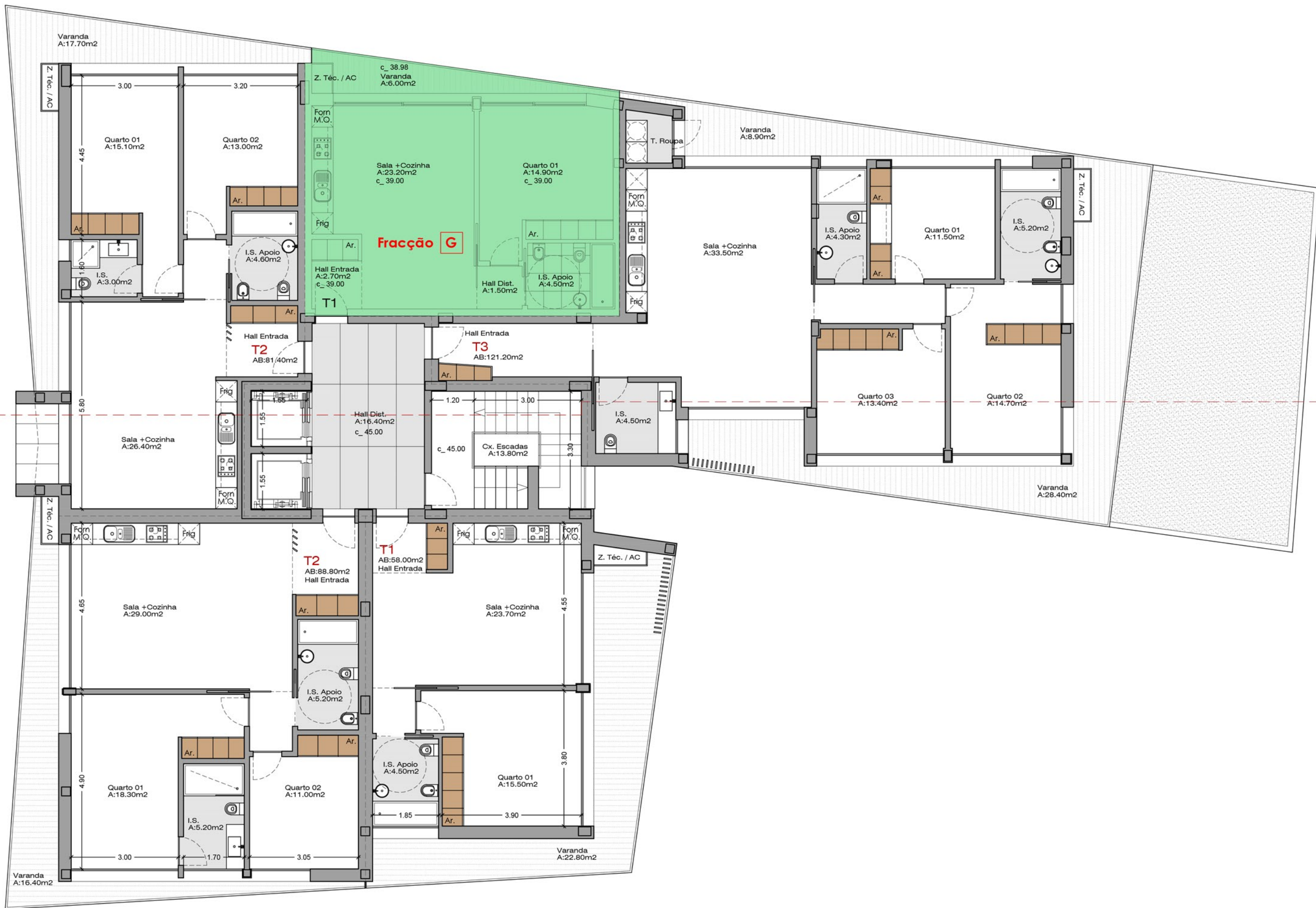
PLANTA DO PISO 1 e PISO 2