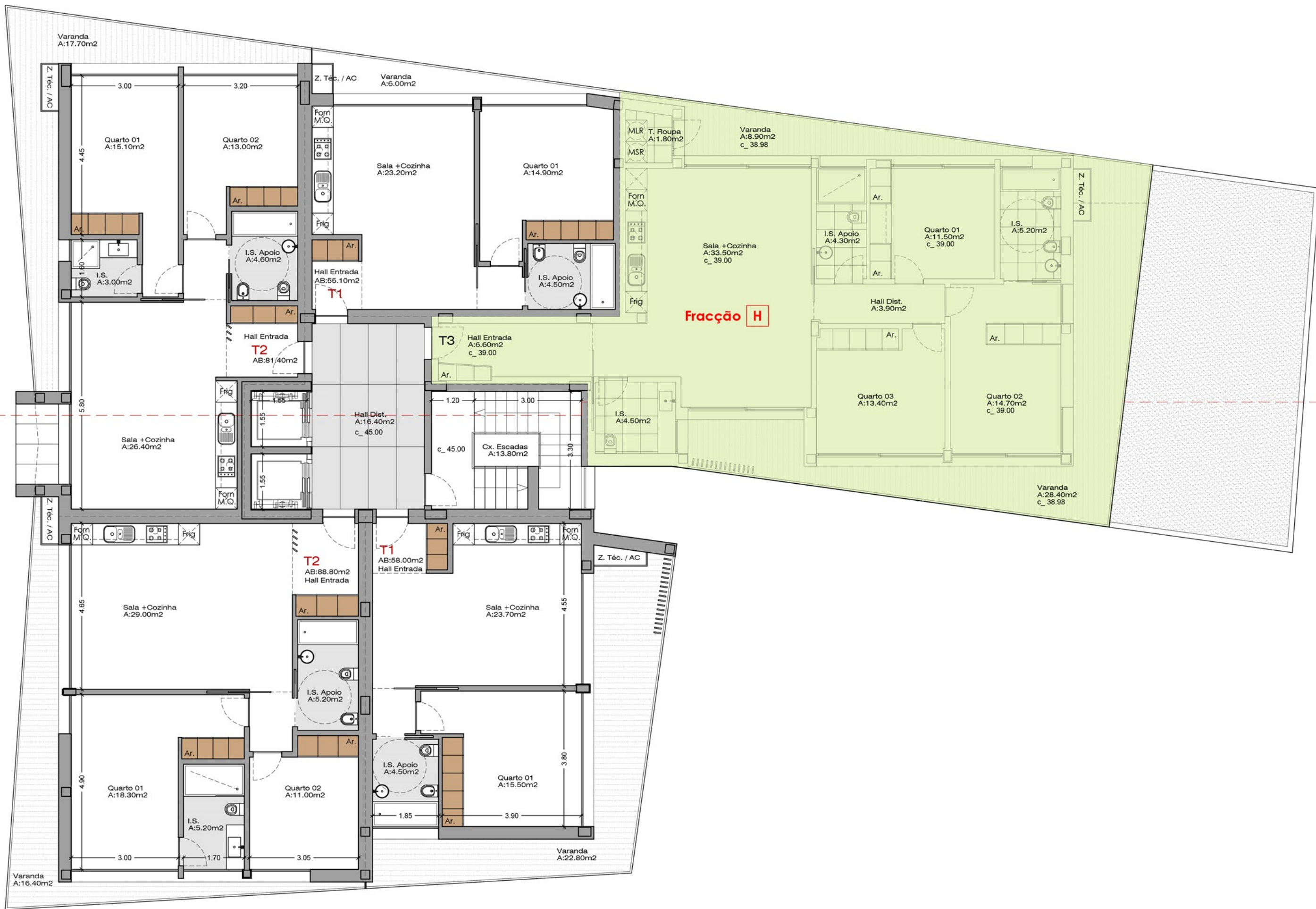
PLANTA DO PISO 1 e PISO 2