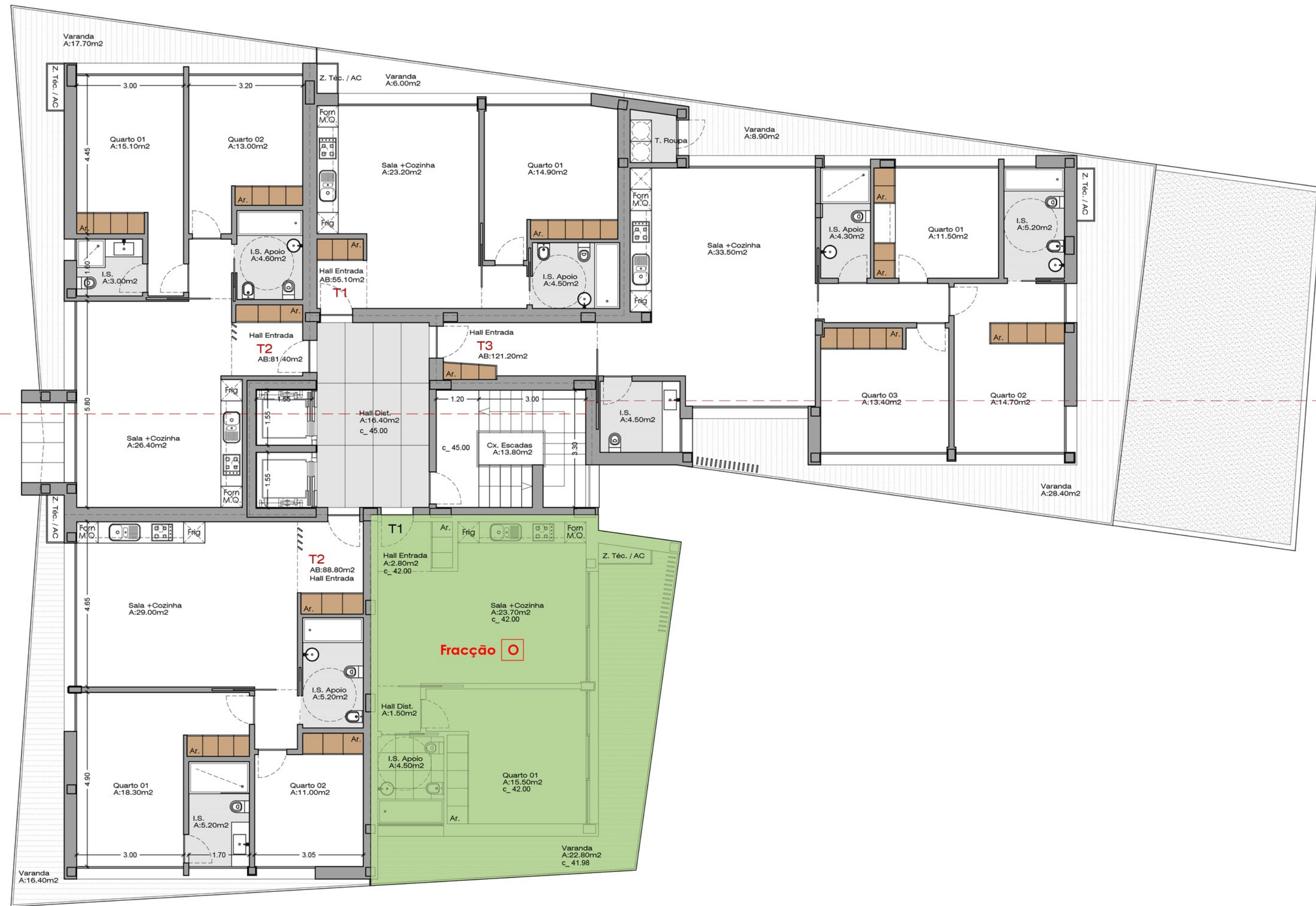
PLANTA DO PISO 1 e PISO 2